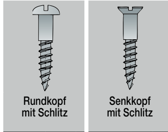
Rundkopf mit Schlitz