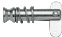
Bolzen mit Klappzunge Aus rostfreiem Stahl